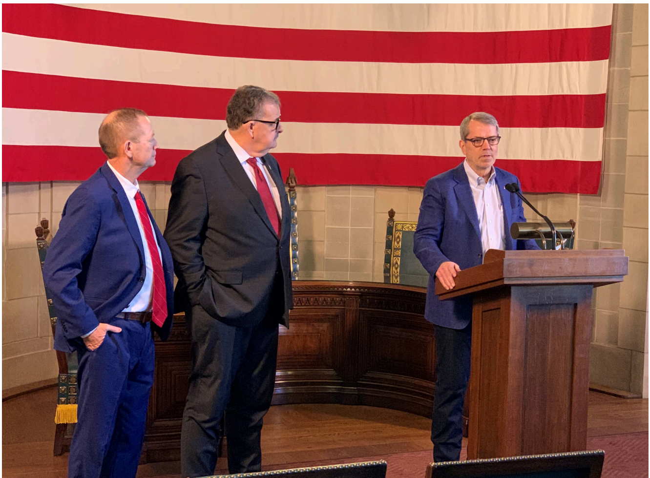
Governor Jim Pillen at the podium

"It's important we not only defend agriculture but go on the offensive," said Gov. Pillen. "The better agriculture does, the better our economy does. I'm eager to work with the legislature this year to lead the nation and protect and grow our agriculture industry."