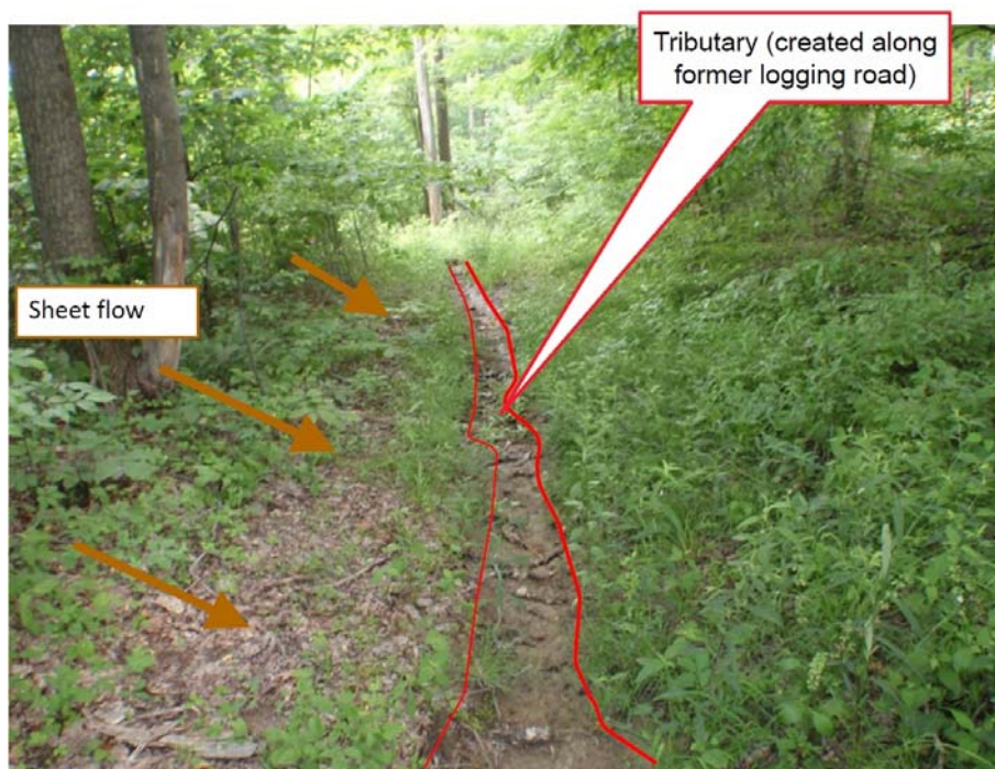
Figure 1: The red lines likely constitute an “ordinary high water mark,” and the feature is likely to be deemed a “navigable water.” Am. Petroleum Inst. Comments 129, ID-15115 (Ex. E).

The Rule ignores this admonition. If allowed to come into effect, it would allow the agencies to assert federal regulatory jurisdiction over desiccated ditches (as “tributaries”) and any isolated water features that happen to be nearby (as waters with a “significant nexus”). For example: