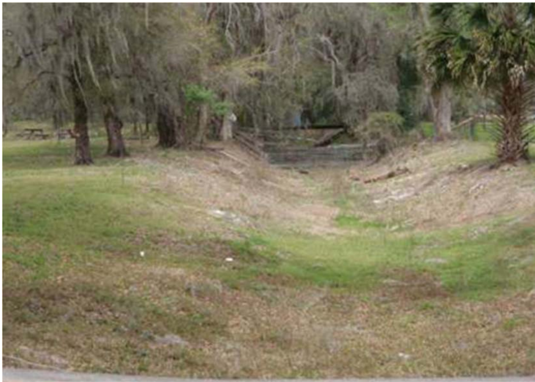
Figure 2: Dade City Canal in Florida is not currently a WOTUS but would likely be deemed a “tributary” under the 2015 Rule. Fla. Stormwater Ass’n Comments 10, ID-7965 (Ex. F).