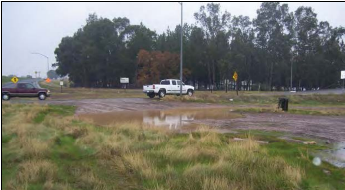
Figure 6: Delineated “Water Feature 21” in Project SPK 2002-00641. See Staff of S. Comm. on Env’t & Pub. Works, 114th Cong., Expansion of Jurisdiction Claimed Under the Clean Water Act 21 & n.87 (2016), perma.cc/W6U3-583Y (Ex. Q).

This is not a hypothetical concern. The Corps determined that the following feature is not a parking-lot puddle, but a jurisdictional wetland . According to common experience, it's a puddle :