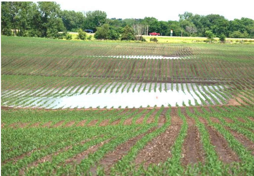
Figure 5: Small “depressional wetland” or large puddle? AFBF Comments App. A at 38 (Ex. G).

Categorical exemptions. Many of the rule’s categorical exemptions from jurisdiction are also vague. For example, the agencies inserted an exemption for “[p]uddles.” 33 C.F.R. 328.3-(b)(4)(vii). But what is a puddle? The agencies assert jurisdiction over “depressional wetlands” (80 Fed. Reg. at 37,093), without regard for size or permanence. When does a recurring puddle become a small depressional wetland? For example: