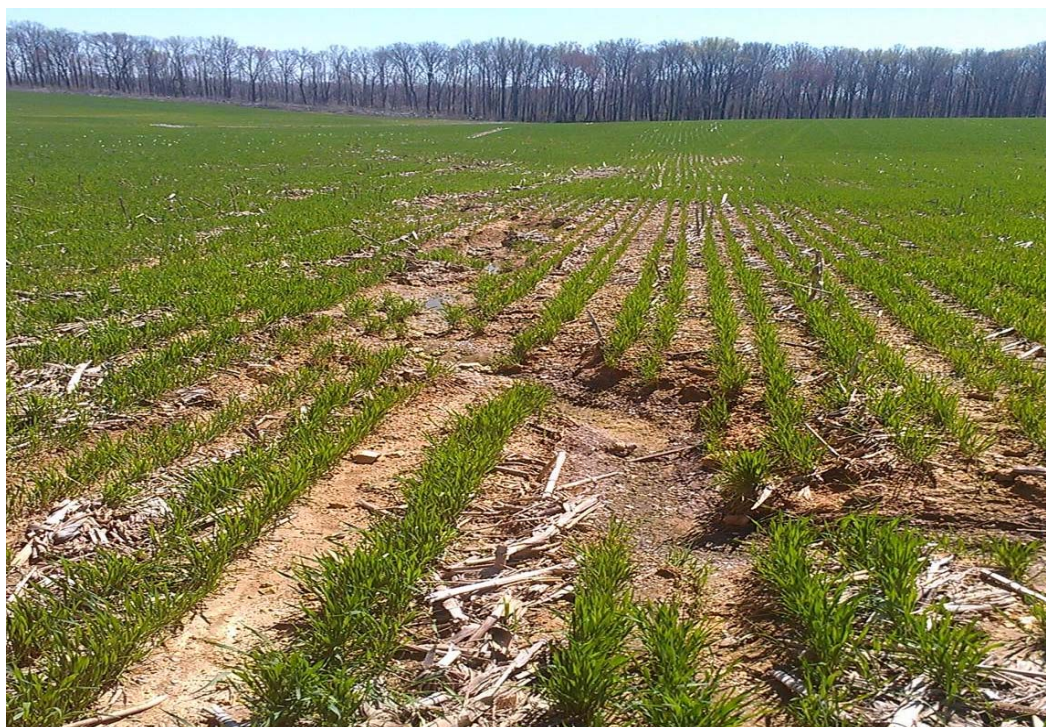
Figure 3: This feature was deemed a WOTUS in 2014 after the Corps concluded that it exhibits an ordinary high water mark. AFBF Comments, App. A at 31, ID-18005 (Ex. G).