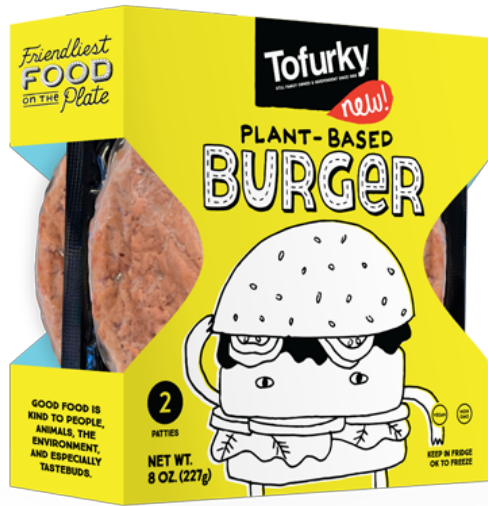
Illustration 1: Examples of Tofurky products and marketing