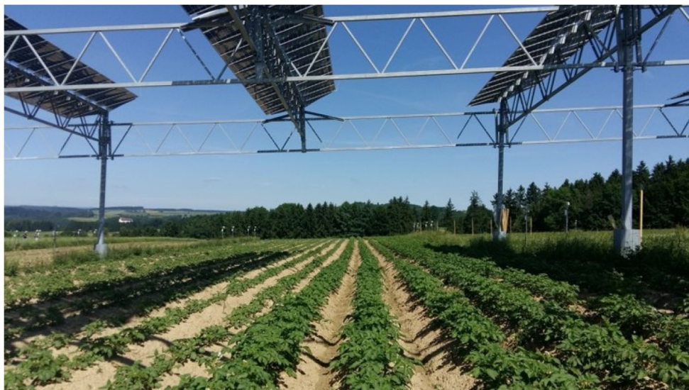
Fig. 1 Potatoes growing underneath an APV facility. The facility was set up within the project APV RESOLA and is located at Heggelbach, administrative district of Sigmaringen, Germany. Its implementation in agricultural production is currently investigated