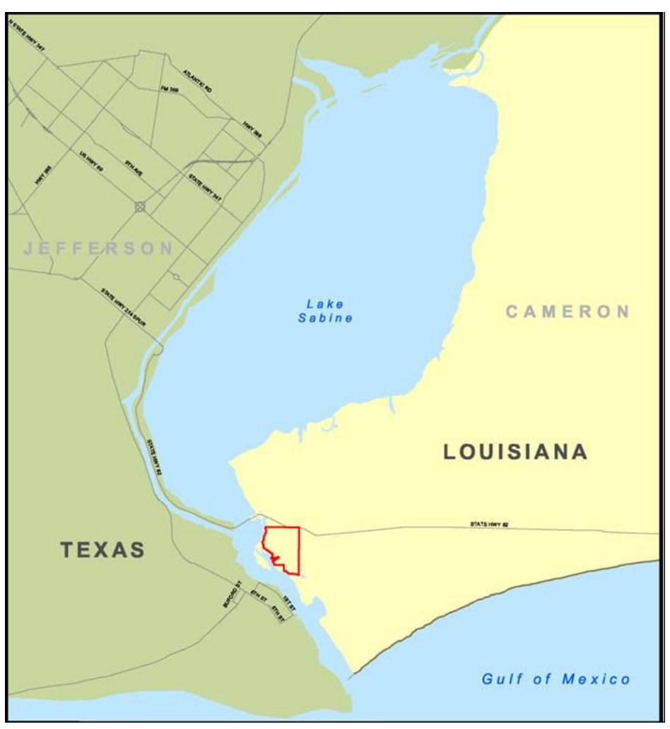
Figure 1.4-1 General Location Map

All proposed Project facilities will be located entirely within the 853-acre site previously leased in conjunction with the development of the existing SPLNG Terminal. The locations of the proposed facilities are depicted in Figure 1.4-1. A topographic map and aerial photography of the Project are included in Appendix 1A.