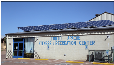
Figure 1: Examples of Facility-, Community-, and Utility-Scale Solar Energy Projects on Tribal Lands

A 192-kilowatt solar photovoltaic system was installed on the Tonto Apache Tribe's Fitness and Recreation Center in Arizona. The installation was part of a 2014 project co-funded by a DOE grant.