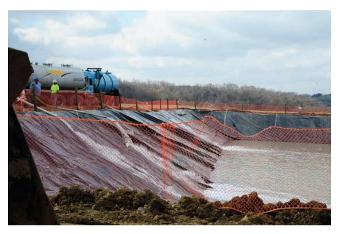
The disposal of fracking wastewater in open pits contributes to air pollution, while leakage from improperly lined pits has contaminated groundwater and surface water. Chemicals present in fracking wastewater have been linked to serious health problems, including cancer.

of the world's largest water filtration plants. New York has already had to take this step for one major source of drinking water, spending $3 billion to build a filtration plant for the part of the watershed east of the Hudson River.<sup>27</sup> The cost of doing the same for areas west of the Hudson, which sit atop the Marcellus Shale formation, was estimated in 2000 to be as much as $6 billion.<sup>28</sup>