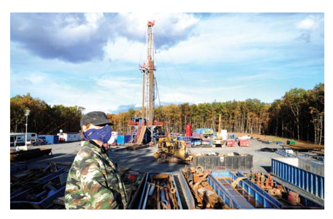
Fracking can be a dangerous business for workers. The National Institute for Occupational Safety and Health recently found dangerous levels of airborne silica at fracking sites in several states, while workers also risk injury from traffic accidents, falling objects, explosions and other hazards. Workers, their families and the public often bear much of the costs of workplace illness and injury.

tions during fracking. As silica is moved from trucks to the well site, silica dust can become airborne. Without adequate protection, workers who breathe in silica dust can develop an elevated risk of contracting silicosis, which causes swelling in the lungs, leading to the development of chronic