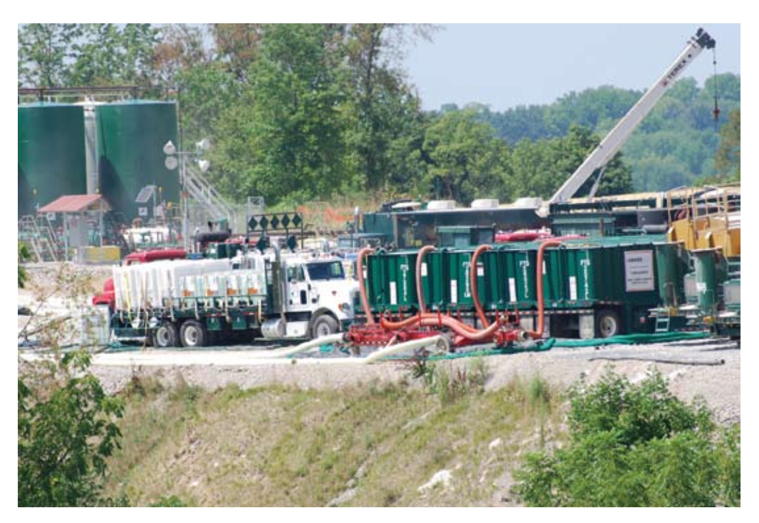
Fracking requires millions of gallons of water and large quantities of sand and chemicals, all of which must be transported to well sites, inflicting damage on local roads. Above, a well site in Washington County, Pa.

each fracking well requires approximately 400 truck trips for the transport of water and up to 25 rail cars' worth of sand.86 The process of delivering water to a single frack-