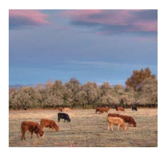
Fracking poses threats to farming, both directly through the potential loss of livestock due to exposure to toxic contaminants, and indirectly by increasing farmers' costs of doing business during the "boom" portion of the boom-bust cycle of development. Here, cows graze in Erie, Colorado, which has experienced fracking activity.

In arid western states, some farmers face higher costs for water as a result of competing demands from fracking. A 2012 auction of unallocated water conducted by the Northern Water Conservation District saw natural gas industry firms submit high bids, with the average price of water sold in the auction increasing from $22 per acrefoot in 2010 to $28 per acre-foot in the first