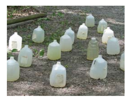
Residents of Dimock, Pennsylvania, are among those who have reported drinking water contamination in the wake of nearby fracking activity. Here, discolored water from local wells illustrates the change in water quality following fracking.

Less dramatic, but just as important, are the long-term implications of fracking—including the economic burdens imposed on individuals and communities. In this paper, we outline the many economic costs imposed by fracking and show that, absent greatly enhanced mechanisms of financial assurance, individuals, communities and states will be left to bear many of those costs.