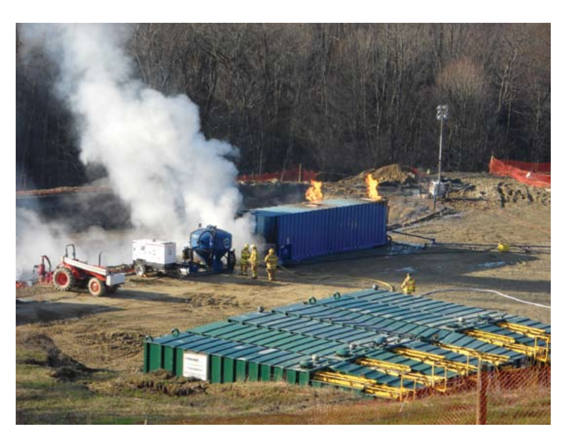
Volunteer firefighters respond to a fire in a wastewater pit at an Atlas Energy Resources well site in Washington County, Pa., in March 2010. Fracking places increased demands on emergency responders, creating new dangers that require additional training, and increasing demands for response to traffic accidents involving heavy trucks.

to costs is when a well plug fails, requiring attention years later. Chemical, mechanical or thermal stress can cause the cement to