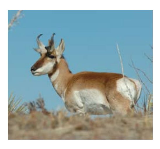
Pronghorn antelope are among the species that have been affected by intense natural gas development in Wyoming.

lution reduction targets designed to restore the bay to health. 69 Based on an estimate of the cost per pound of nitrogen reductions from a recent analysis of potential nutrient trading options in the Chesapeake Bay watershed,<sup>70</sup> the cost of reducing nitrogen pollution elsewhere to compensate for the increase from natural gas development would run to approximately $1.5 million to $4 million per year.