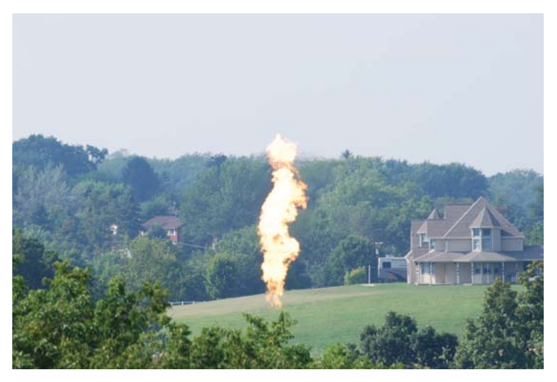
In parts of the country, fracking takes place in close proximity to homes, schools and hospitals, creating the potential for conflict. A Texas study has found that some homes near fracking well sites have lost value. Above, a natural gas flare near homes in Hickory, Pa.

While estimates of the costs of plugging and remediation of fracked wells vary, those costs almost always exceed a state's bonding requirements. Pennsylvania's recently revised bonding requirements, for example, require drillers to post maximum bonds of only $4,000 per well for wells less than 6,000 feet in depth and $10,000 per well for wells deeper than 6,000 feet, creating the potential for the public to be saddled with tens or hundreds of thousands of dollars in liability for plugging and reclamation of abandoned wells whose owners have gone bankrupt or walked away from their responsibilities. ^{105} The experience of previous resource extraction booms and busts suggests that the full bill for cleaning up orphaned wells may not come due for decades.