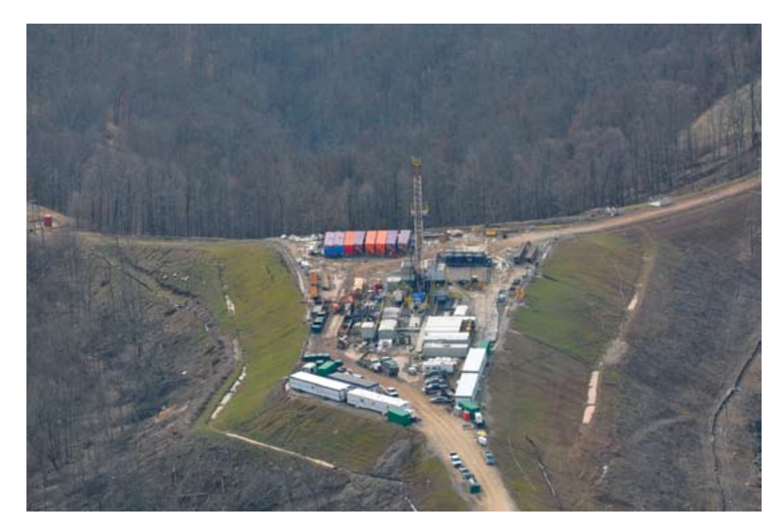
Fracking imposes a range of environmental, health and community impacts. Above, a fracking well site is built in a forested area of Wetzel County, W.Va.

draulic fracturing, to operate that well, and to deliver the gas or oil extracted from that well to market.