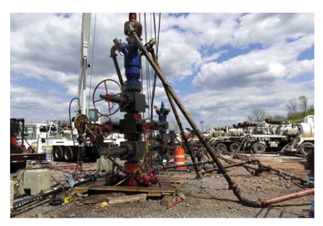
Equipment is put in place in preparation for hydraulic fracturing at a well site in Troy, Pa. In bydraulic fracturing, a combination of water, sand and chemicals is injected at high pressure to fracture oil or gas-bearing rock formations deep underground.

Once the necessary machinery and materials are assembled at the drilling site, drilling can begin. The well is drilled to the depth of the formation that is being targeted. In horizontally drilled wells, the well bore is turned roughly 90 degrees to extend along the length of the formation. Steel "casing" pipes are inserted to stabilize and contain the well, and the casing is cemented into place. A mix of water, sand and chemicals is then injected at high pressure—the pressure causes the rock formation to crack, with the sand propping open the gaps in the rock. Some of the injected water then flows back out of the well when the pressure is released ("flowback" water), followed by gas and water from the formation ("produced water").