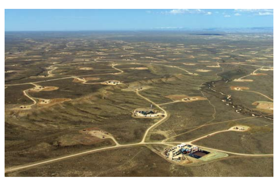
Oil and gas development fragments valuable natural habitat. Above, the Jonah gas field in Wyoming.

Other natural features affected by fracking—including groundwater, rivers and streams, and agricultural land—provide similar natural services. The value of all of those services—and the risk that an ecosystem's ability to deliver them will be lost—must be considered when tallying the cost of fracking.