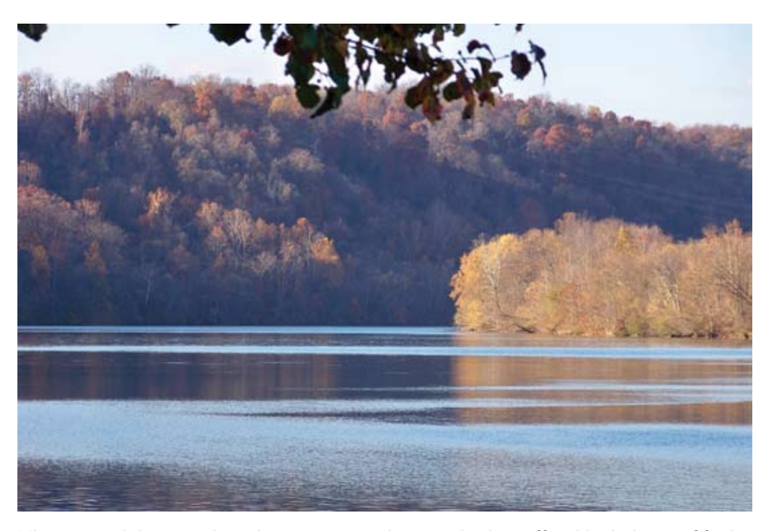
The Monongahela River, shown here at Rices Landing, Pa., has been affected by discharges of fracking wastewater and by water withdrawals for fracking. A 2011 Army Corps of Engineers report concluded that "the quantity of water withdrawn from streams [in the Monongahela watershed] is largely unregulated and is beginning to show negative consequences."

Spills, blowouts and other accidents related to fracking have caused numerous fish kills in Pennsylvania. In 2009, a pipe containing freshwater and flowback water ruptured in Washington County, Pennsylvania, triggering a fish kill in a tributary of Brush Run, which is part of a high-quality watershed. That same year, in the same county, another pipe rupture at a well drilled in a public park killed fish and other aquatic life along a three-quarter-mile length of a local stream.