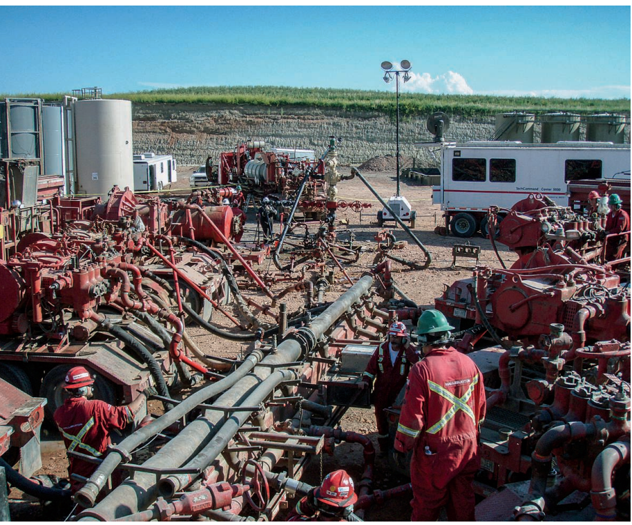
Hydraulic fracturing at the Bakken Formation in North Dakota. A mixture of water and fracking fluids are pumped into the ground.